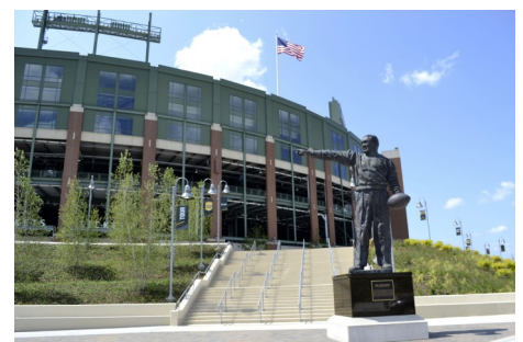
Join us for a tour & dinner at Lambeau Field!